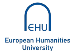
European Humanities University